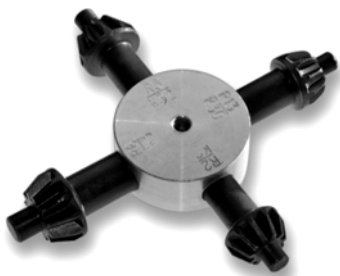
Model CD1 Industrial Keys w/ Magnet