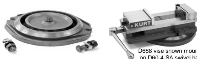
D688 vise shown mounted on D60-4-SA swivel base